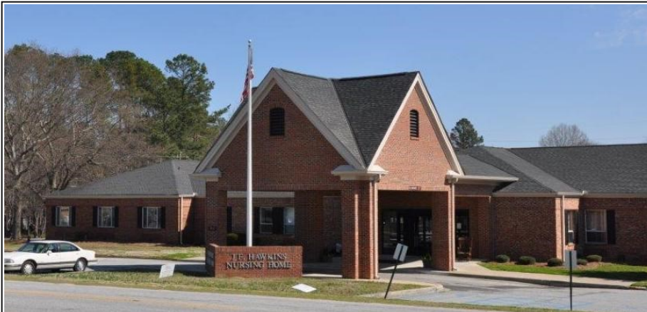
Nursing Home case — The J.F. Hawkins Nursing Home in Newberry County, the site of a case in which an elderly patient died after repeated falls.